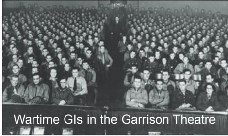
Wartime GIs in the Garrison Theatre

Salisbury Plain during the War was a hive of military activity, as soldiers trained for the planned invasion of Europe. The Salisbury Plain Garrisons were the first port of call for thousands of American troops arriving from the USA. Tidworth was effectively an American base. Here, troops were brought to the peak of fitness out on the Plain and were entertained and given briefings in the Garrison Theatre, before being equipped and moved on to the Channel ports from where they embarked in the landing craft for the journey to the Normandy beaches.