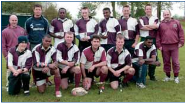
Cup Winners : 1 CHESHIRE (picture) Runners Up : 1 Mech Bde HQ & Sig Sqn (215)