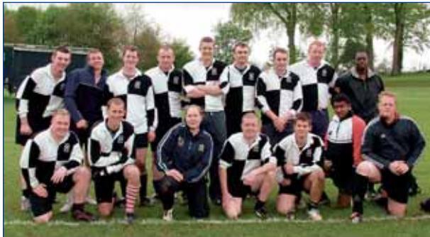
Plate Winners : 1RHA (A Team) (picture) Runners Up : 6Bn REME (B Team)