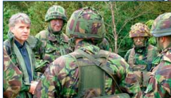
Mamba and Cobra,

which are used for surveillance and target acquisition. Mamba is being used in Iraq for Force Protection; easily deployable, it is able to locate the source of an incoming shell to enable a rapid response. Cobra is bulkier and therefore less easily deployed, but it can see further and is faster than Mamba, giving commanders a Theatre overview of the battlefield.