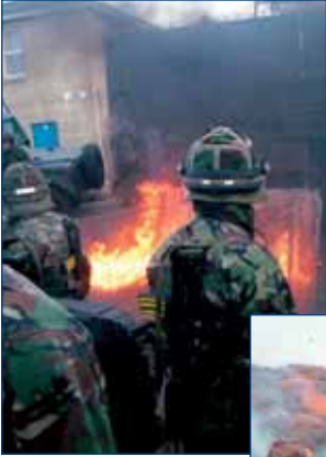
< Public Order training

Soldiers from 2RGJ involved in firefighting on the ranges at Ballykinler