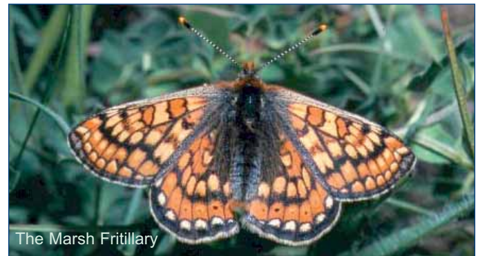
The Marsh Fritillary