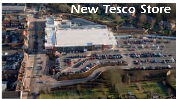
New Tesco Store

After the parade, the Duchess met privately with the families of soldiers who were injured or killed during the tour, afterwards mingling with soldiers and their families at a reception at the barracks.