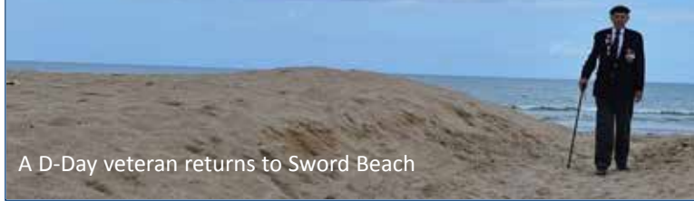
A D-Day veteran returns to Sword Beach

Troops serving with 3rd (UK) Division have returned to Normandy to commemorate the D-Day landings, exactly 70 years after the formation led the assault on 'Sword Beach' on 6 June 1944.