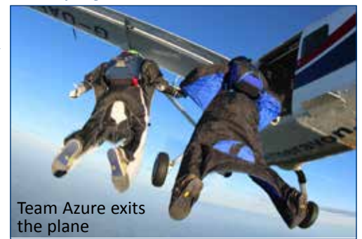
Team Azure exits the plane

During the event British competitor Tony Uragallo set a new World Record for distance flown in a wingsuit, achieving 4.2km in a 1,000 metre vertical competition window.