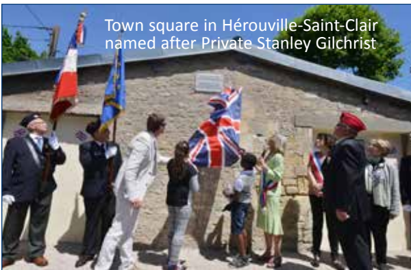
Town square in Hérouville-Saint-Clair named after Private Stanley Gilchrist