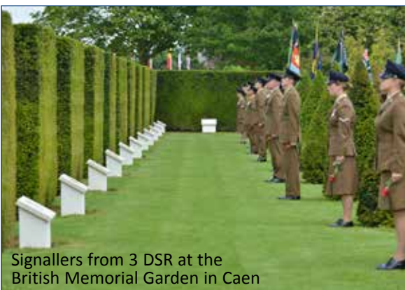
Signallers from 3 DSR at the British Memorial Garden in Caen