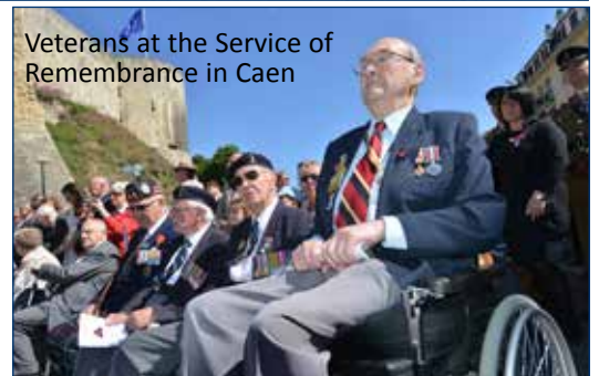
Veterans at the Service of Remembrance in Caen

"Once again the eyes of the world are focused on Normandy. We take strength from the memory and example set by those who lived through the horrors of 1944.