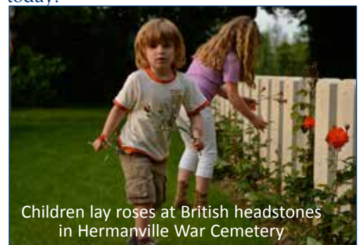
Children lay roses at British headstones in Hermanville War Cemetery

"We never forget our wonderful veterans - who enabled the freedom of Europe, and in doing so contributed so much to the history of this region. And we pay respect to the former D-Day battlefields that continue to shape who we are today."