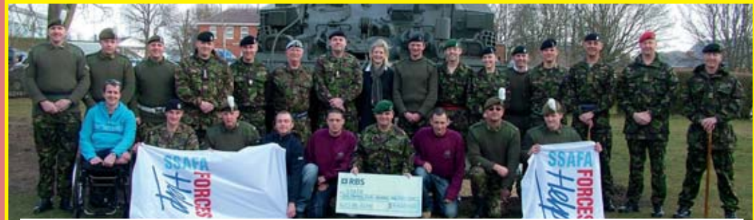
Back in uniform to present a cheque for £4465 to SSAFA Salisbury Plain

Log on to the BFBS website to watch a short video of this X-Factor style show ! Log on to : www.bfbs.com or follow the link to it from the Drumbeat website : www.drumbeat.org.uk