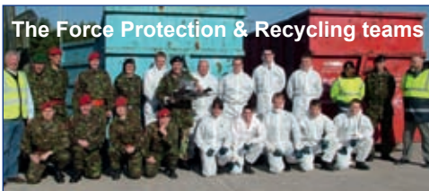
The Force Protection & Recycling teams