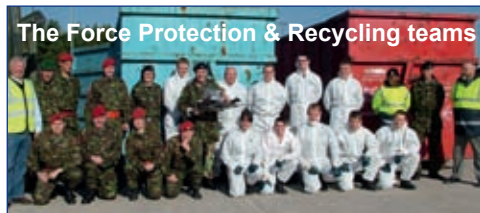
The Force Protection & Recycling teams