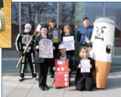
Kiwi Primary School (above) The Wellington Academy (right)

Local schools took part in the Army Primary Health Care poster competition to draw attention to this year's 'No Smoking Day' on 14th March.