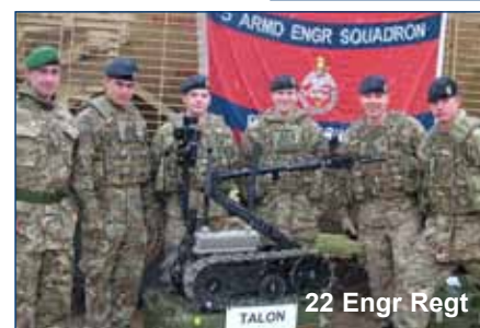
22 Engr Regt