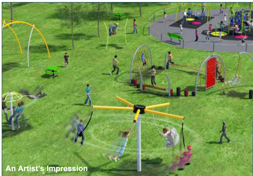
An Artist's Impression

The Defence Infrastructure Organisation (DIO) is planning to improve three play areas for Service families in Bulford and Tidworth, as part of a targeted programme to improve play parks in most need. This is great news and Drumbeat will keep you informed of progress !